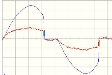
50% Dim Level Waveform Capture