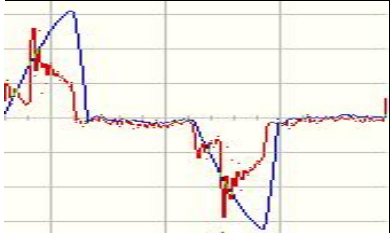
50% Dim Level Waveform Capture